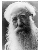
Charles Koechlin, 1948

Charles Koechlin (1867 – 1950) studied at the prestigious Ecole Polytechnique in Paris, but tuberculosis prevented him from following the military career that was expected of him. Fortunately he turned to music, studying composition with Fauré and Massenet at the Paris Conservatoire. He worked incredibly quickly when inspired, and his output of 219 opus numbers covers all genres: from the vast orchestral work, ' Le Livre de la Jungle ', inspired by Kipling; to choral, chamber and solo works. He loved the flute and seemed to understand the subtleties as if he played himself.